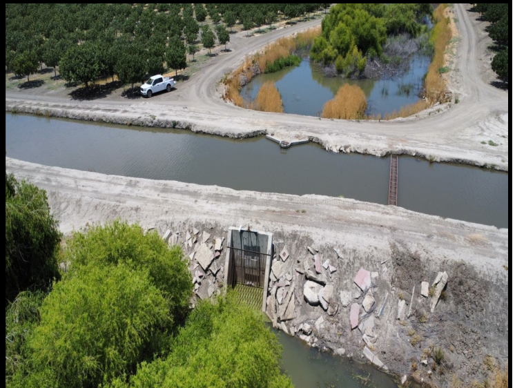
Mud Dam - June, 2023