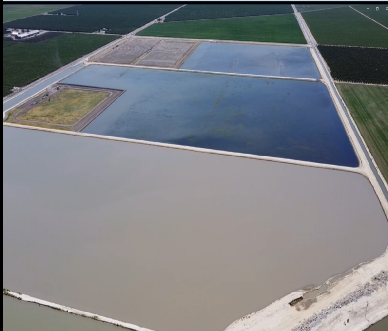
Lateral K Recharge Basin including Solar Projects 1 & 2. When completed, solar fields will be flooded for recharge, serving a dual purpose. - June, 2023