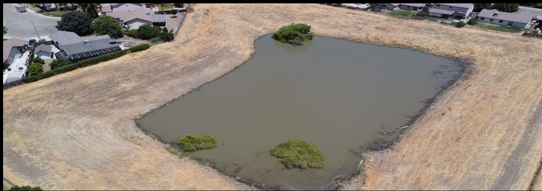
Colorado Avenue Recharge Basin , City of San Joaquin - June, 2023